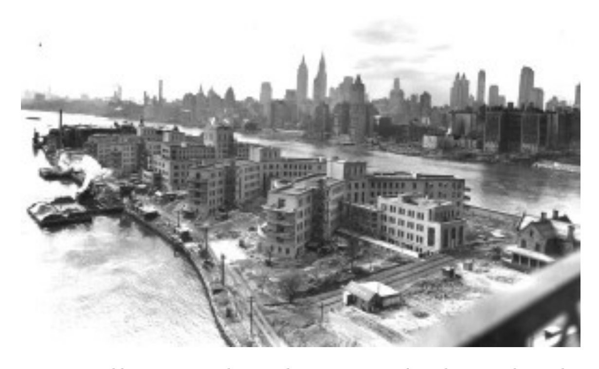
Figure 0.2. Goldwater Memorial Hospital in 1938, as seen from the Queensborough Bridge. This vast chronic disease hospital was located on Welfare Island (later called Roosevelt Island), a two-mile sliver of land in the East River nestled between the Upper East Side and Astoria. In addition to caring for a large number of chronic disease patients, Goldwater included clinical research departments associated with the Columbia, Cornell, and NYU medical schools. The hospital, opened in 1939, was an immense facility designed to be a new model of medical care for patients with chronic illnesses. Researchers in the Columbia unit solved the anti-malaria drug problem during World War II. Many of those researchers were recruited to lead the clinical and research programs of the newly expanded NIH. The hospital closed in December 2013, but before its destruction, a detailed photographic record was made (http://urbanomnibus.net/2014/04/autopsy-of-a-hospital-a-photographic-record-of-coler-goldwater-on-roosevelt-island/).